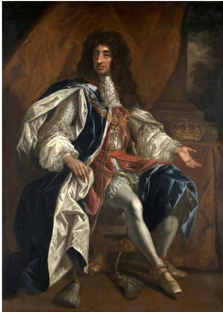
Charles II, King of England