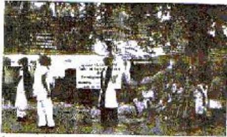
A group of four students of Salgaocar College of Law perform a street play at a street corner